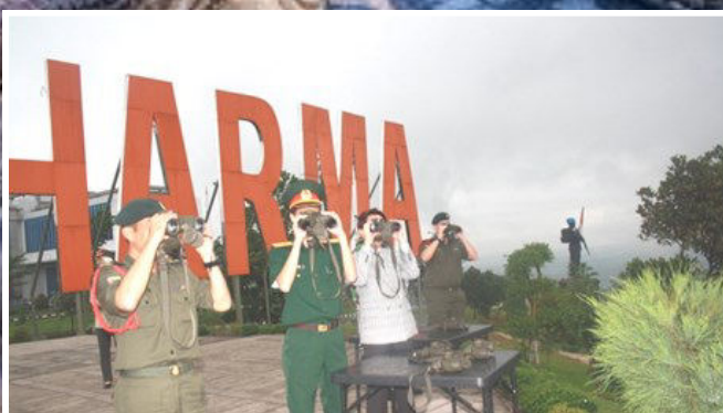
Viewing the Compounds of IPSC