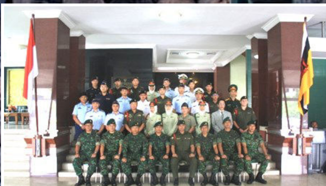
Group Photo with KOSTRAD Officers