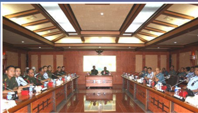
Visit to Mabas TNI