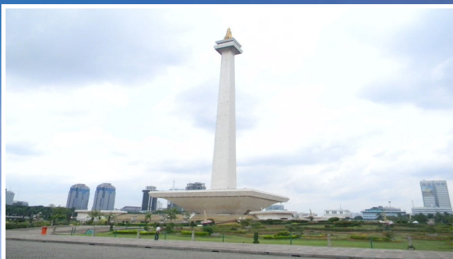
Pride of Indonesia (MONAS)