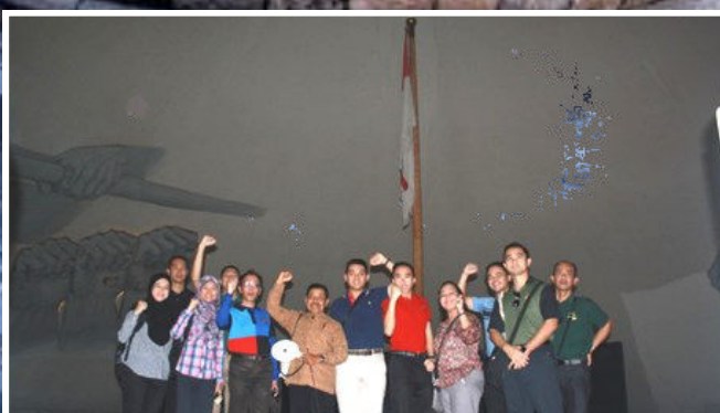
Yogya Kembali Museum