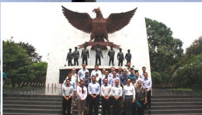
7 Heroes of Lobang Buaya Monument