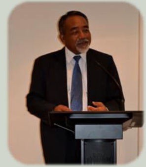
His Excellency Mr Lalduhthlana Ralte

India. 5 th Nov 12, JSC 12 were given a brief on Indian Foreign Policy by His Excellency Mr Lalduhthlana Ralte, the Indian High Commissioner. The students gained valuable insights into Indian foreign policy. The keystone of which is the idea of 'Vasudhalva Kutumbakam' which means, 'the world is one large family'. The primary objective of Indian foreign policy is to improve the lives of their own people through sustained development and they try to achieve this through cooperation rather than confrontation. Energy Security and Climate Change are two other main focuses of Indian Foreign Policy according to the High Commissioner.