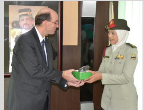
His Excellency received a token of appreciation from Deputy Commandant DA