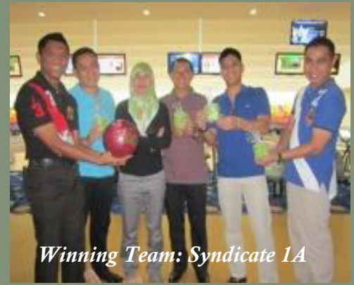
Winning Team: Syndicate 1A

The session was incredible fun for both students and instructors of JSC 2012. All syndicates had managed to exercise their excellent teamwork efforts with a high spirit of competition throughout the activity. Moreover, the activity provided an experience that will become unforgettable memories for the students when they look back to the times they shared together as course mates.