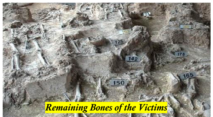
Remaining Bones of the Victims