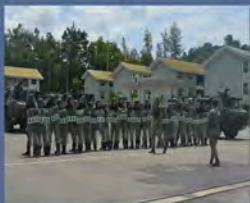
PUBLIC ORDER Pg.3