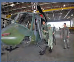
HELI EMBUS/DEBUS DRILLS Pg.3