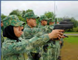
HANDGUN P226 Pg.2