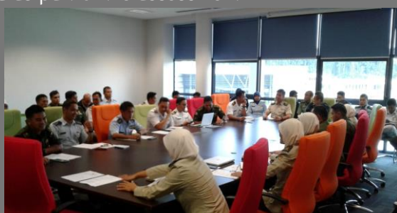
Students and DSs during a mock up meeting exercise