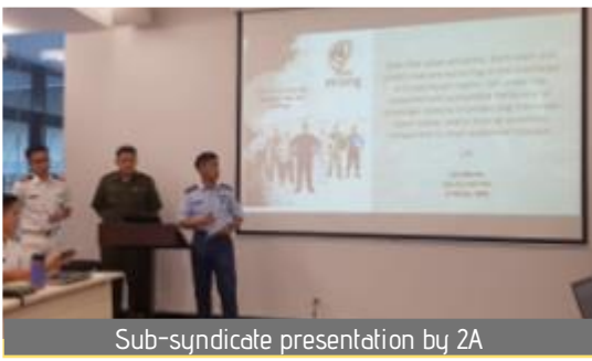
Sub-syndicate presentation by 2A