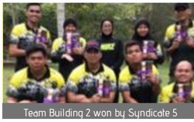
Team Building 2 won by Syndicate 5

Friday, 26 April 2019 – The Team Building Activity 2 was organised by Syndicate 1 & 4 for the ISC 19/2019. The activity was held at Berakas Forest Reserve with all the LMC staffs participated in the games. There were 3 games conducted which consisted of Minefield Game, The Perfect Square and Marshmallow Spaghetti. The 3 games objectives were focused on Trust, Communication, Effective Listening, Leadership as well as Teamwork. The winner of the games was Syndicate 5.