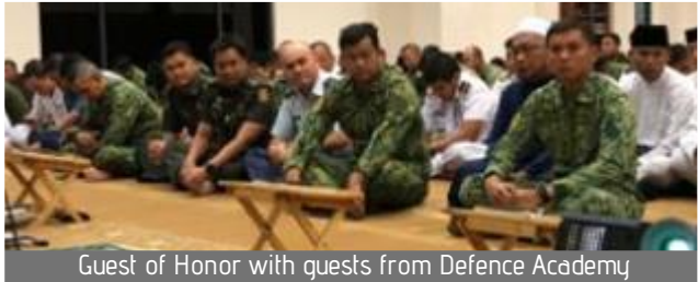
Guest of Honor with guests from Defence Academy