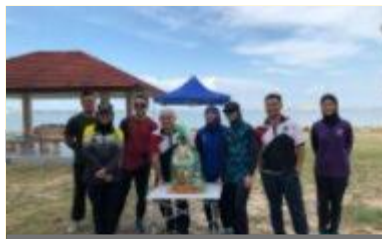
Team Building Activity 3 won by LMC Team

Friday 3 May 2019 - The Team Building Activity 3 was organised by Syndicate 2 & 3 for the ISC 19/2019 which was held at the Serasa Beach. The Amazing Race was a combination of 3 games which consisted of Bull Ring, Treasure Hunt and Chinese Whisper. The key points that can be taken were teamwork, communications and following instructions. The activities ended with a cohort reflective session and followed by syndicates' reflections. The winner of the activity was the LMC Team.